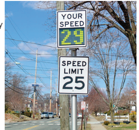
Driver Feedback Signage