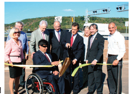
Chimney Rock Interchange Ribbon Cutting

In October of 2013 the Regional Center Partnership received notification from the State Planning Commission that all qualifications had been satisfied to be granted Plan Endorsement, assuring that the region will continue to be designated as an official “Regional Center” for the next ten years.