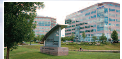
Somerset County is home to the world's major corporate headquarters

Somerset County companies are engaged in initiatives to develop and improve 3-D printing and production, 5G telecommunications deployment, commercialization of disease therapies and numerous other manufacturing and research initiatives.