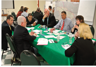
Planning sessions have helped to set the Regional Center agenda

The SOMERSET COUNTY BUSINESS PARTNERSHIP (SCBP) is Central New Jersey's premier business resource. As an enhanced Chamber of Commerce, the Partnership represents business interests and shared economic, educational, and quality-of-life goals.