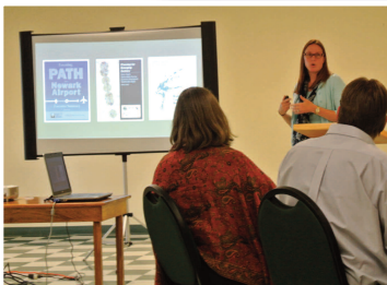
Setting goals for the Regional Center at the 2015 Visioning Workshop

The United States Economic Development Agency approved the CEDS, explaining, "The priorities and focuses...will help form the